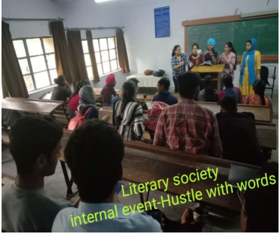
Literary society internal event-Hustle with words