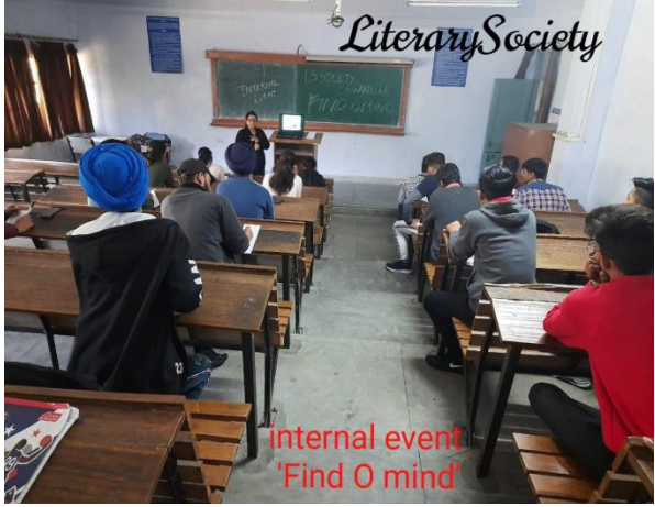
internal event 'Find O mind'